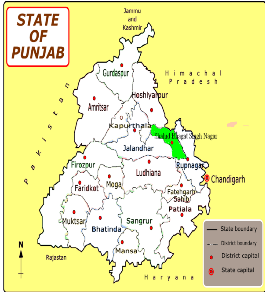
Fig: 2.1 Map of Punjab State